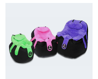
SOS P Pod