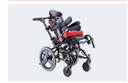
Freedom Designs NXT (Folding)