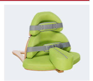
Akces MED Nook