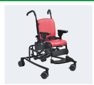
Activity Chair (With Hi Lo base)