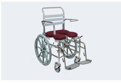
Juvo (Self Propelled)