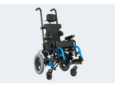
Zippie Iris (Folding / Rigid)