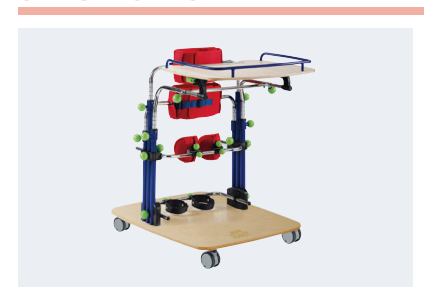
Ormesa Mini Standy