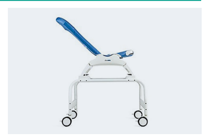
Rifton Wave (On shower stand)