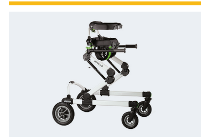
Ormesa Grillo (Anterior or Posterior)