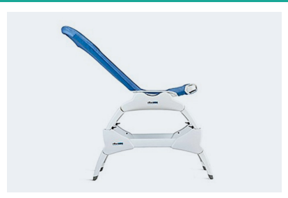
Rifton Wave (On bath stand)