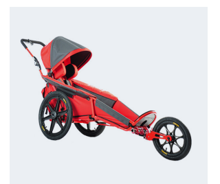
Volter xRover (Jogging)