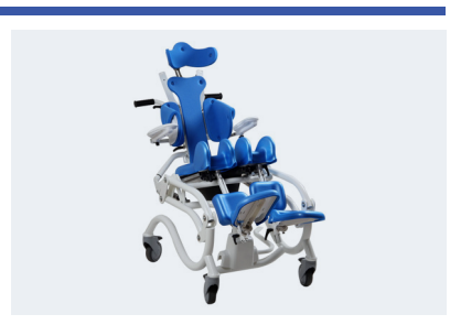
Anatomic SITT Starfish Pro