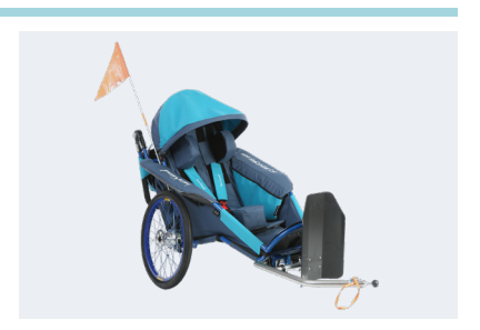
xRover With bike attachment