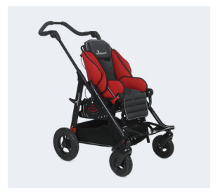
Thomashilfen Jazz AdvantageS (Tilt & Recline)