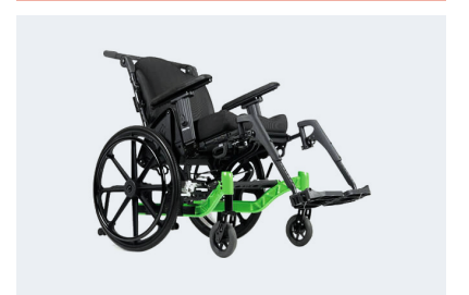
PDG Mobility Fuse T50