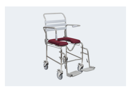
Juvo (Attendant Propelled)