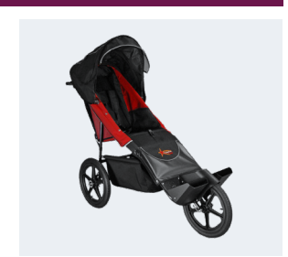
Adaptive Star Endeavour