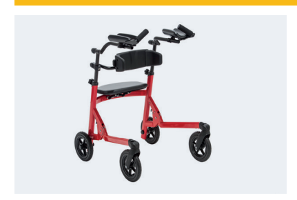
Schuchmann Malte Posterior