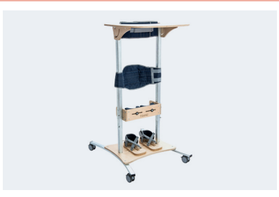
Akces MED Smart Stander