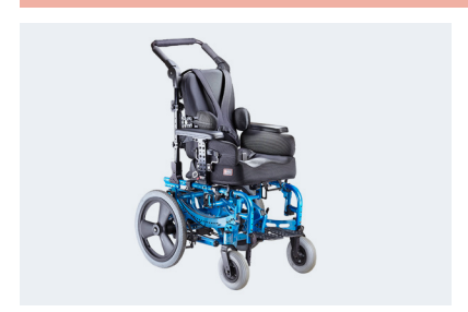
Freedom Designs Pro Tilt (Rigid)