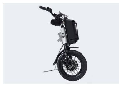
Klaxon Klick Monster